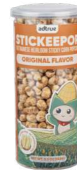
StickeePop Original Flavor

StickeePop - Vietnamese Heirloom Sticky Corn Popcorn