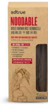
Noodable Dried brown rice vermicelli

Ingredients: 80% brown rice, 20% green aromatic banana powder