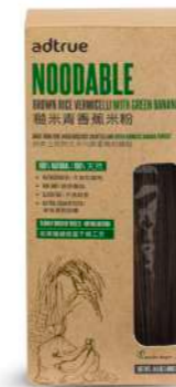
Noodable Brown rice vermicelli with green banana