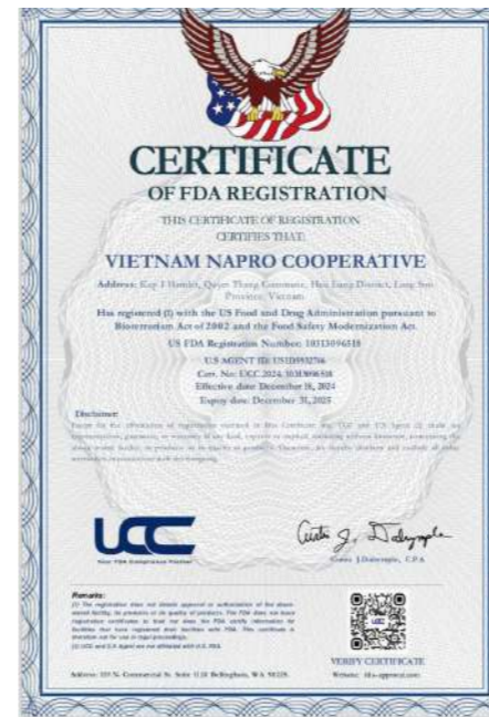
Certificate of FDA Registration Vietnam Napro