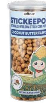
StickeePop Coconut Butter Flavor