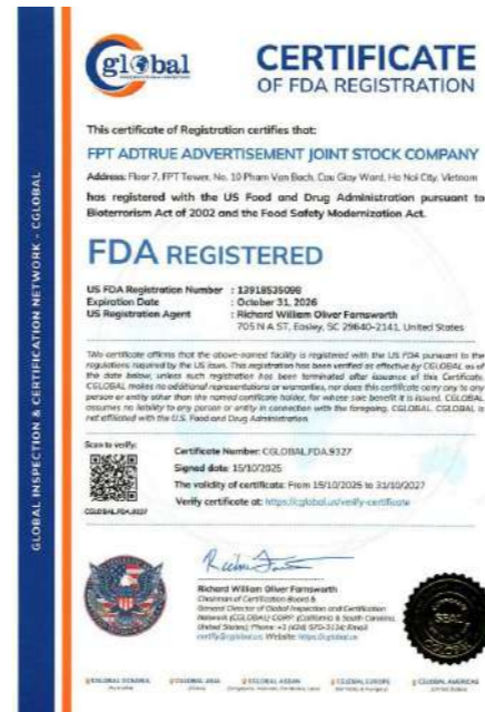
Certificate of FDA Registration FPT AdTrue