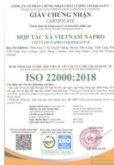
Vietnam Napro Cooperative ISO 22000 : 2018