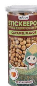
StickeePop Caramel Flavor

Ingredients: ancient sticky corn, organic cane sugar, coconut meat, water, pure matcha powder