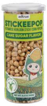
StickeePop Cane Sugar Flavor

Ingredients: ancient sticky corn, coconut meat, organic cane sugar, water, salt