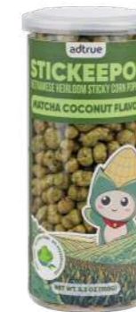
StickeePop Matcha Coconut Flavor

Ingredients: ancient sticky corn, organic cane sugar, water