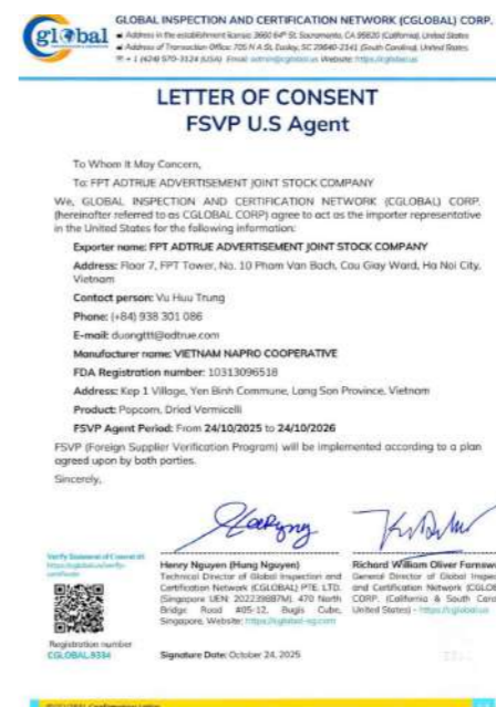
Letter of Consent FSVP U.S Agent